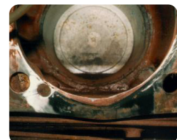
Engine Block Dimensional Restoration