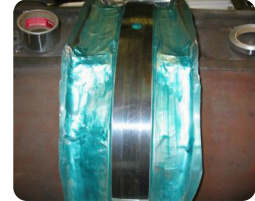
Outside Diameter Bearing Housing Application

Additional qualitative tests, as described in AMS-QQ-N-290 were conducted in which the plated areas were subjected to high stresses and strains. These tests consisted of compressive and tensile bend tests as well as chisel tests into the deposit. The results showed excellent adhesion to the base material.