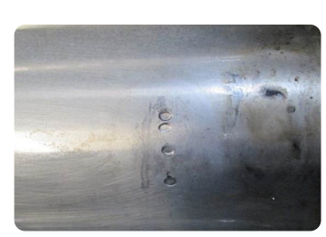
Defect Repair on Blanket Cylinder